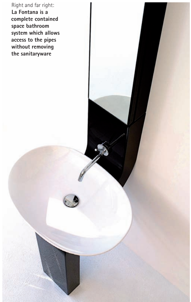
Sharp is a free-standing washbasin for Artceram’s 2008 collection

Right and far right: La Fontana is a complete contained space bathroom system which allows access to the pipes without removing the sanitaryware